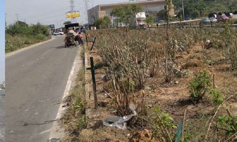
ACTUAL IMAGES OF SECTOR 76 & 77